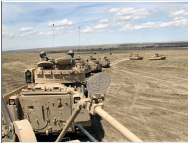
Fort Carson, Colo., faces opposition to its expansion plans for armored training grounds, but cooperation in securing conservation easements for a buffer around the base.

The directive allowing the military to fund land purchases through partnerships led to the creation of REPI. It was a key breakthrough, as the military is not supposed to own land through the initiative. The partnership with the military "has been a very positive relationship," said Keller of the Nature Conservancy in Florida. "We partner with the military on base buffering [and try] to make sure the bases themselves do not become islands of biodiversity surrounded by a sea of houses and strip malls," Keller said.