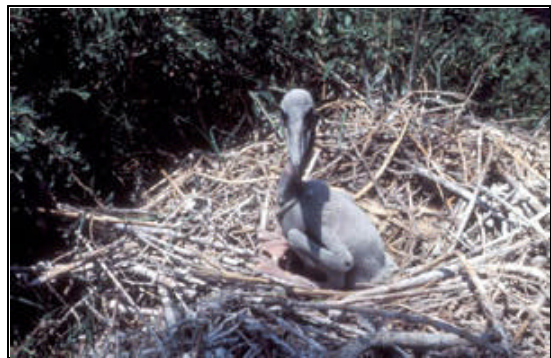
A young California brown pelican in its nest represents another species that has made a strong comeback but apparently is not a federal priority for delisting, environmental activists allege.

Similarly, he said that FWS is planning to remove Rocky Mountain wolves and large portions of land from protections, "because of competing uses by livestock" and others, even though the agency knows that when management is turned over to states there will be wholesale killing of wolves ( Land Letter , March 22). The agency remains at an impasse with Wyoming over wolf management post-delisting, but it is preparing to remove wolf protections in Idaho, Montana and Colorado.