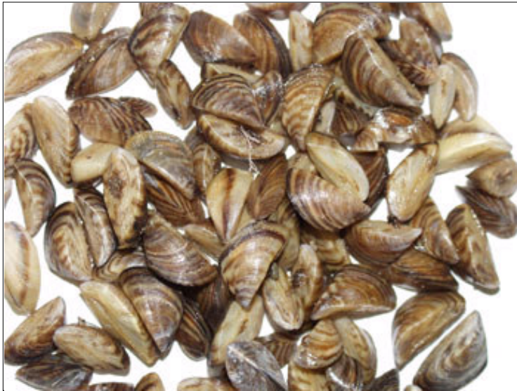
Zebra mussels, difficult-to-control invasive mollusks, have proliferated throughout the Great Lakes and Mississippi River.

They arrive by land, by sea or through the air. Sometimes they are imported on purpose, but often they are unwelcome hitchhikers that stow away inside the hulls of cargo ships or in packing materials carried from distant lands. While most fail to establish new colonies, some will thrive in their new environment, and if not identified and contained, they can spread rapidly.