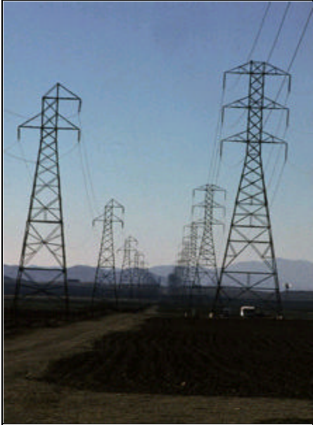
High-voltage transmission line developments pose a threat to Civil War battlefields, landmarks and public lands, say opponents of Energy Department policies to designate national transmission corridors.

Within this huge area, said the trust, there are at least 55 national parks and 14 heritage sites, which also encompasses African-American historic sites, numerous scenic rivers and byways, and the nation's greatest concentration of Civil War battlefields.